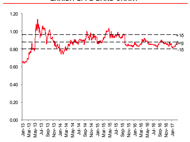
EXHIBIT 2: PB BAND CHART